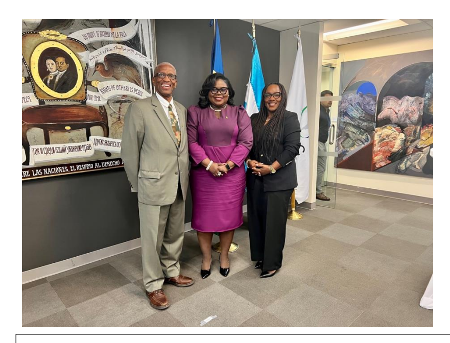
Tuesday September 19, 2023

Top left: The Honourable Keisal Peters, Minister of Foreign Affairs and Foreign Trade chaired the launch of the Fund for Climate Adaptation and Comprehensive Response to Natural Disasters (FACRID) between the Community of Latin American and Caribbean States (CELAC) and the European Union (EU).