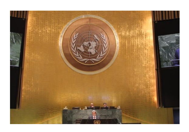
Scenes from the Honourable Prime Minister's addressing the General Assembly

Video footage of the Honourable Prime Minister being escorted to the podium.