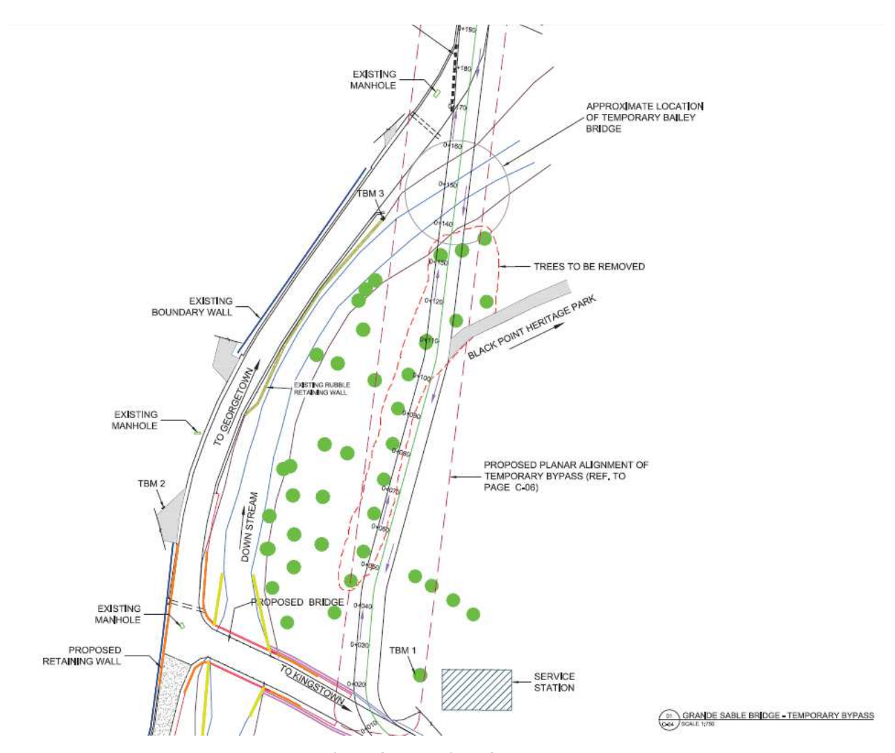
Figure 2 - Location of by-pass road

The by-pass road will be constructed from the existing main highway and diverted through the