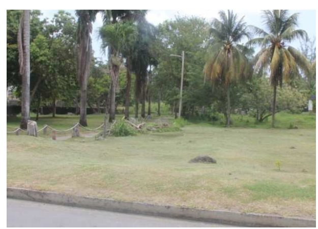
Existing entrance to the Black Point Recreational Park