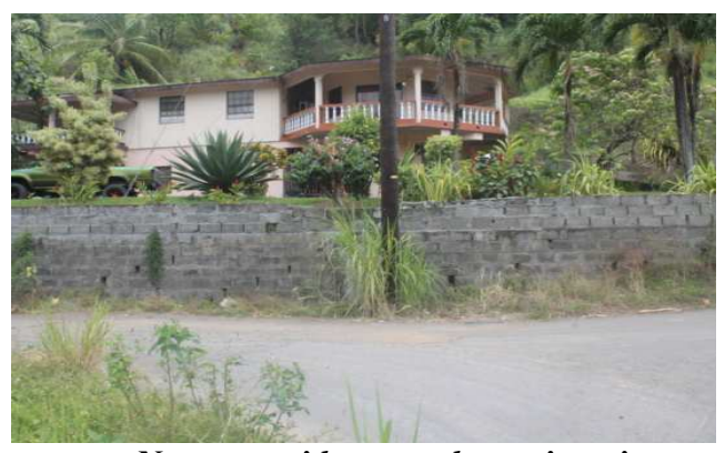
Nearest residence to the project site