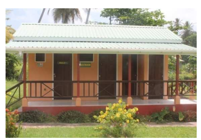
Existing wash room facility